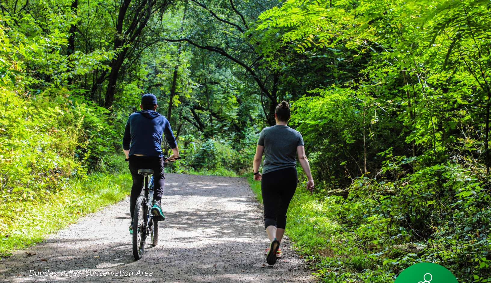
Dundas Valley Conservation Area