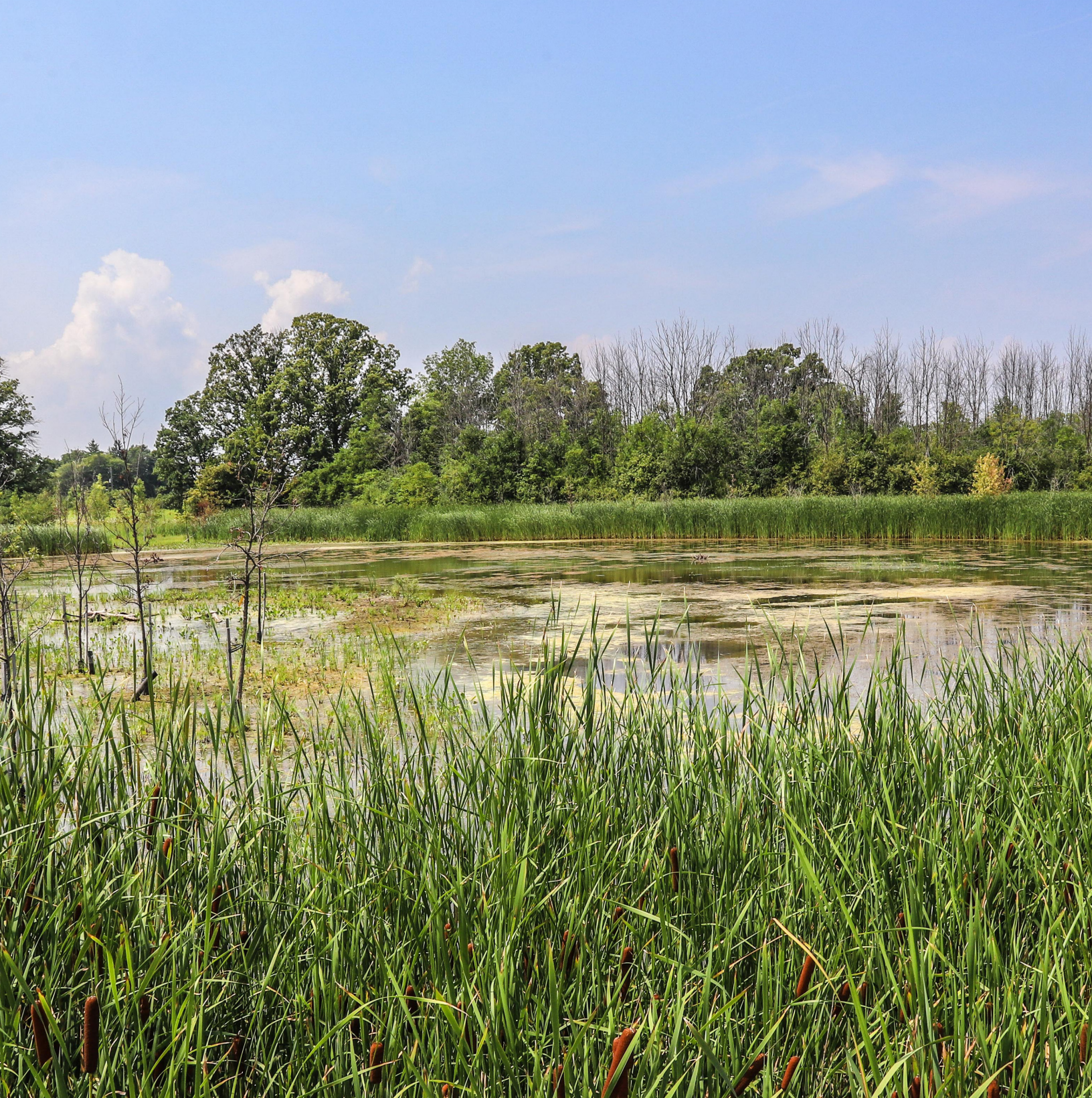
Saltfleet Conservation Area